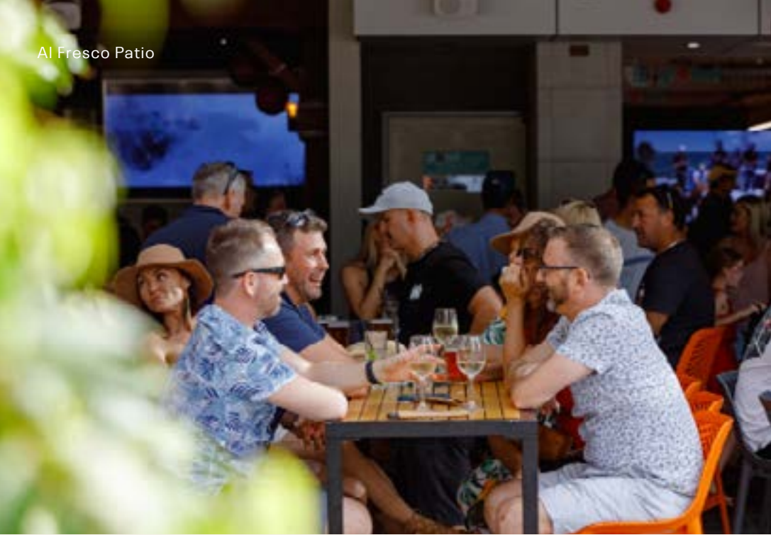
Al Fresco Patio