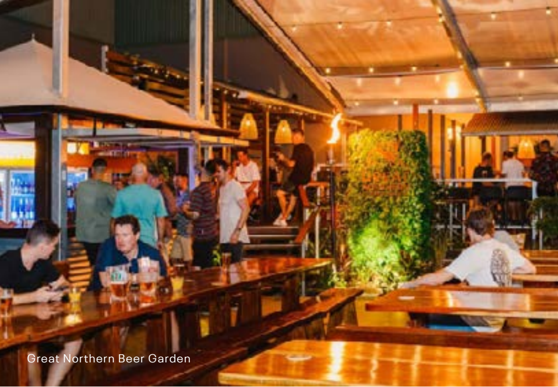
Great Northern Beer Garden