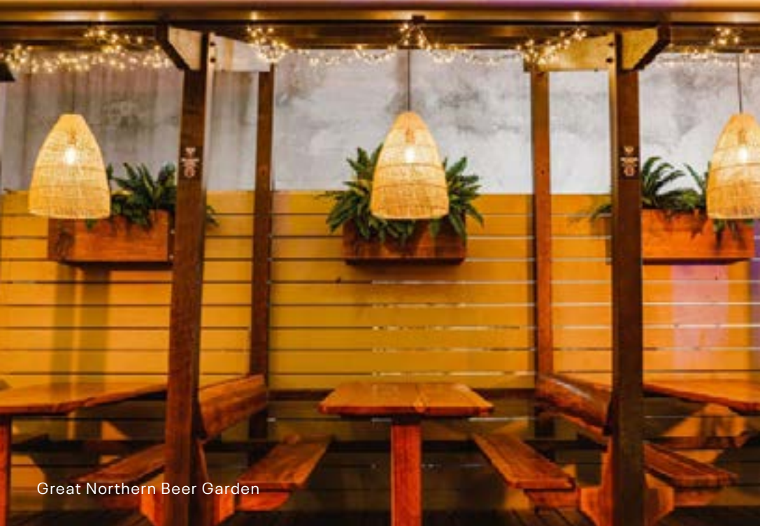
Great Northern Beer Garden