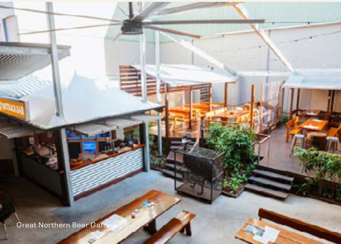
Great Northern Beer Garden