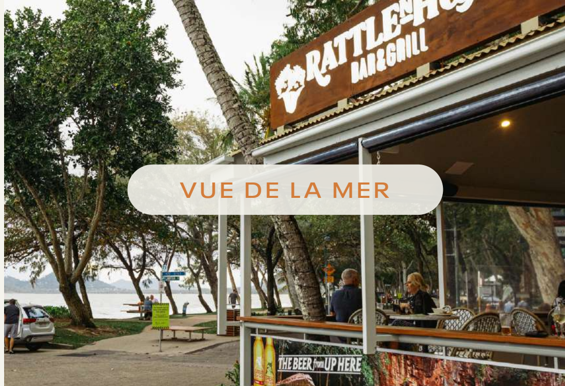
VUE DE LA MER